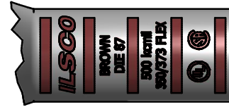
DETAIL E SCALE 1 : 1 INK MARK TOP AND BOTTOM INK COLOR: BROWN